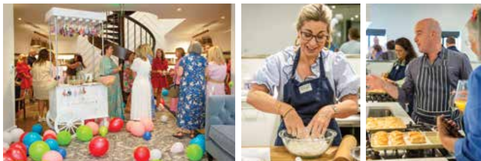
Events, Test Kitchen Partnerships, Recipe Development